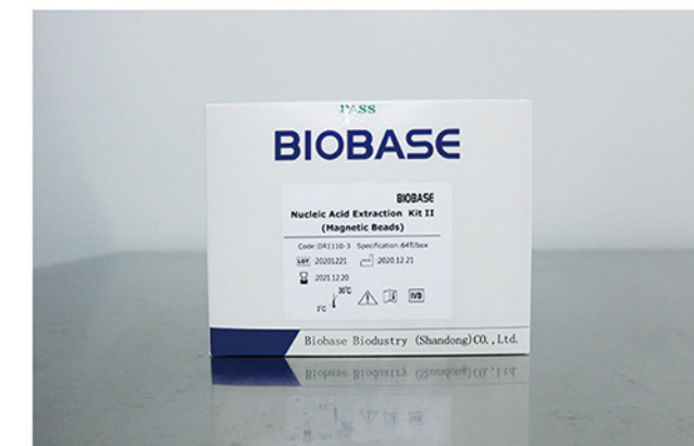
Reagent For BK-HS32/AutoHS96