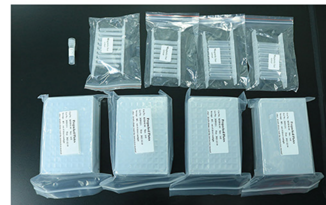
Reagent For BNP32/48