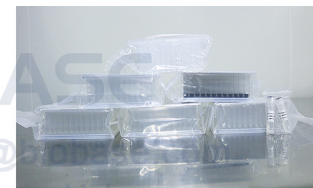
Reagent For BK-HS96